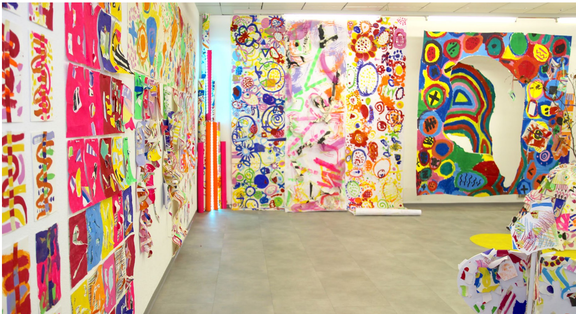
© MUSEO IN ERBA, Lugano (Switzerland)

Ideal exhibitions will probably have to be canceled, others are shortened like the magnificent exhibition at the Museo in Erba in Switzerland.